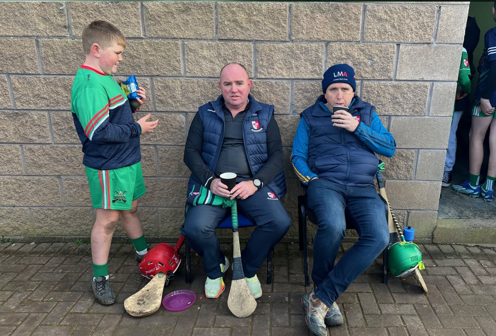
Images of the 2020 Gaelic Games year by the Sportsfile photographers