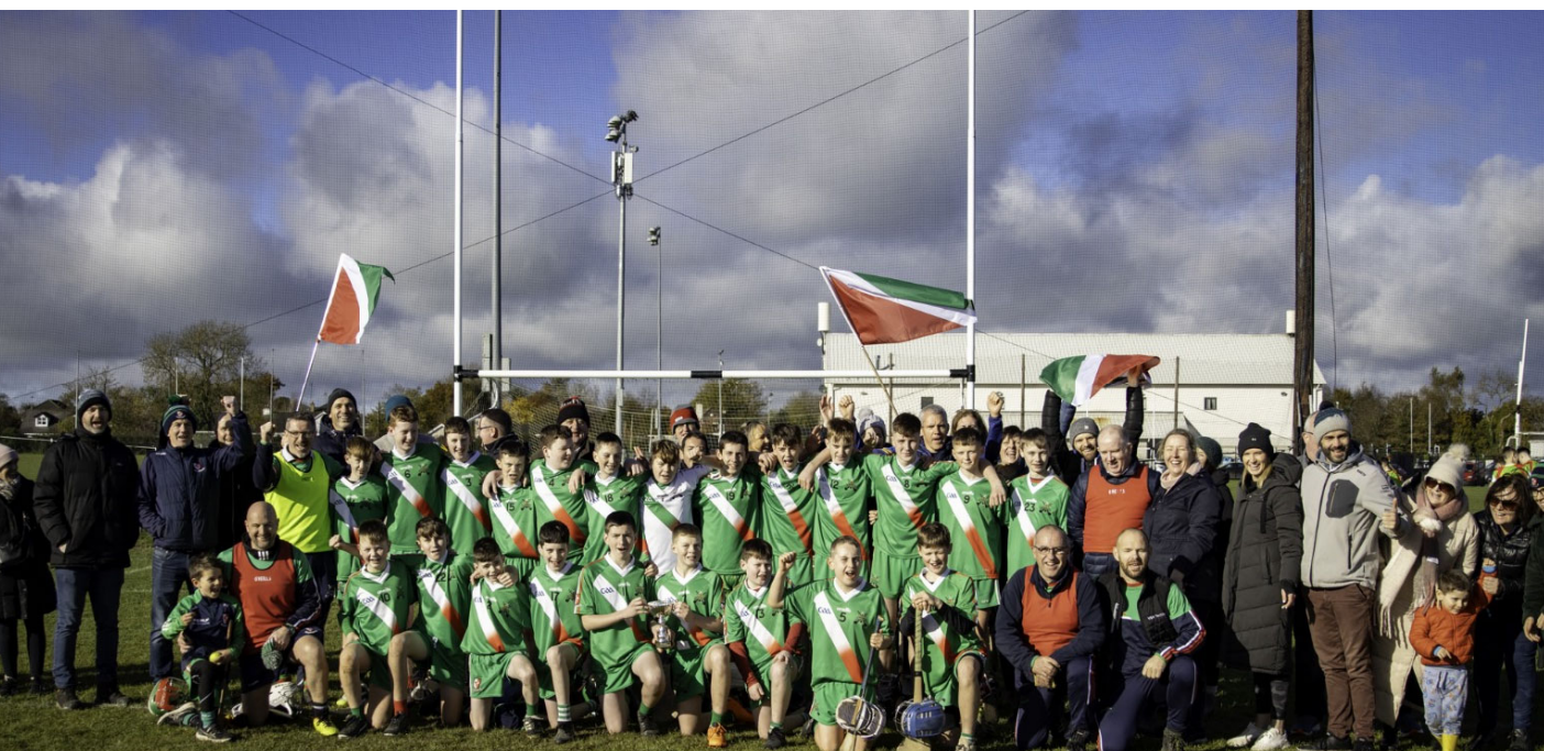
Life Credit Union U14 Hurling League Div2